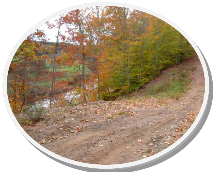
There is still time to save the DAR corridor

NSPACTS urges all three levels of government to work towards acquiring the Windsor-Hantsport Railway Corridor as a greenway corridor, to preserve the corridor for future generations. The abandoned rail corridor through the Annapolis Valley is presently endangered, and needs to be secured as a Greenway as soon as possible. Once, the Dominion Atlantic Railway was the pride of valley residents, employing many people. The elegant maroon and gold Evangeline trains carried New England tourists, university students, workers going home for the weekend, thousands of barrels of apples, bone china, lumber, and dry goods. That era gone, we are left with the abandoned rail beds. The Trans Canada