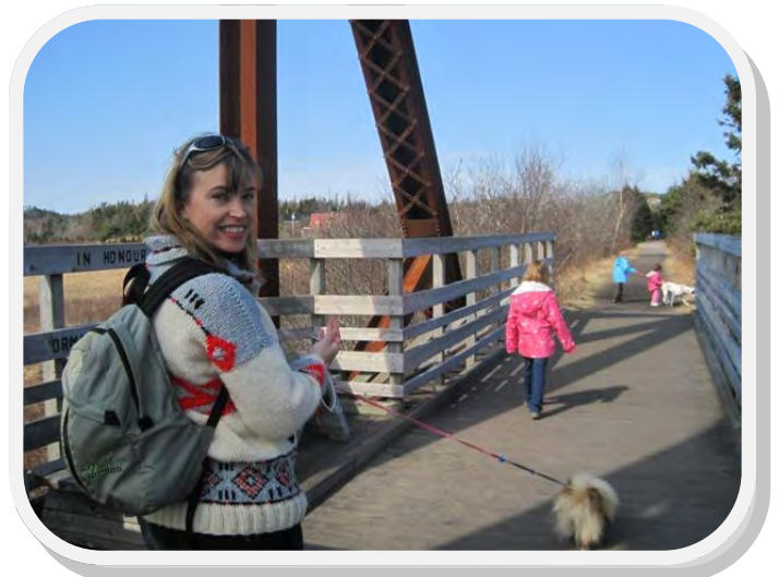
Phase 1 TCT- Musquodoboit Trailway- Musquodoboit Harbour. Built as a Greenway to TCT standards, it attracts active, healthy use for all ages and abilities and encourages environmental awareness.