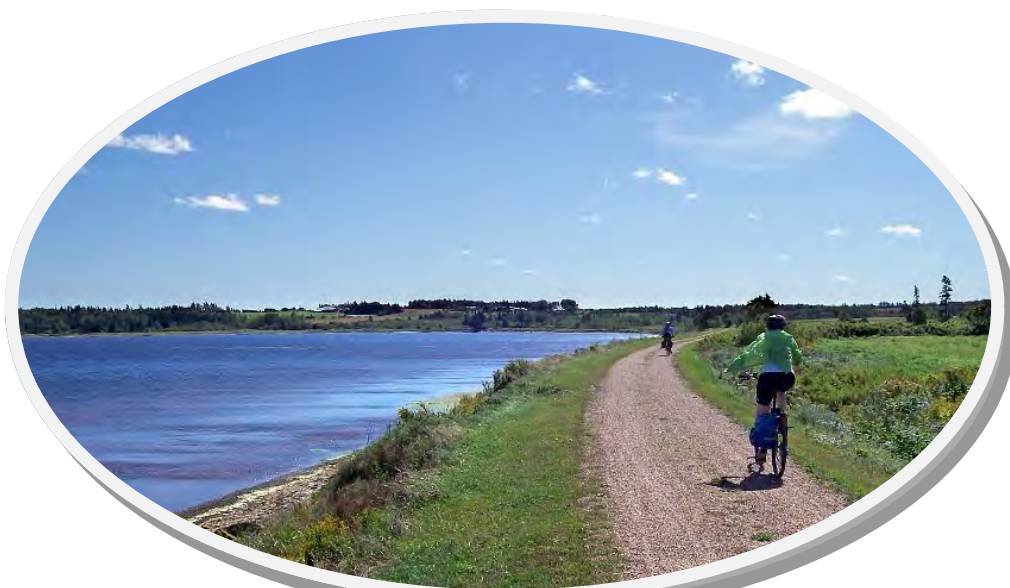
On The Trans Canada Confederation Trail