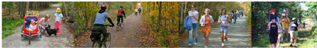
Nova Scotians Promoting Active Transportation on Community Trails 134 Ritson Avenue Cambridge Nova Scotia Canada B0P 1G0